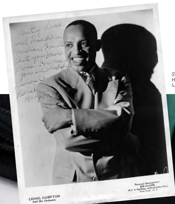
Signed photograph from Lionel Hampton to Leonard Feather. JJC: LF 111.3 0067

The archive is available to students, jazz enthusiasts, musicians and scholars worldwide. View the International Jazz Collections at www.ijc.uidaho.edu or contact the University of Idaho Special Collections and Archives at 208-885-0845 or libspec@uidaho.edu .