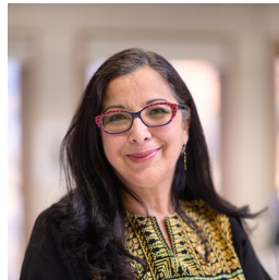
Rula Awwad-Rafferty College of Art and Architecture