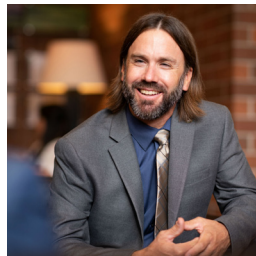
Jerrold Long College of Law