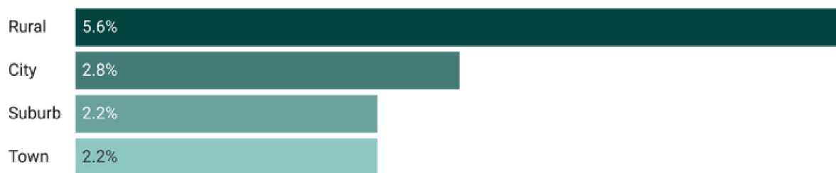
Figure 3. Percent of Students Who Received a GED or Other Equivalency Exam, by Urbanization of Permanent Address