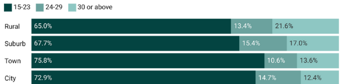
Figure 1. College Students' Age by Degree of Urbanization of Students' Permanent Address

Thirty five percent of rural students attending public or private 4-year institutions are 30 years old or older, which is the highest percent by degree of urbanization of students' permanent address.