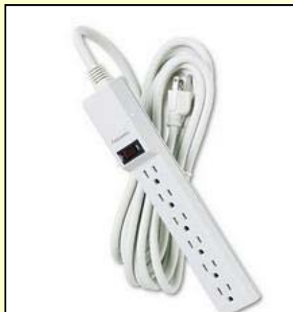
1. 15ft "circuit protected" Power strip

(For additional information, please contact Env. Health & Safety, 885-6524)