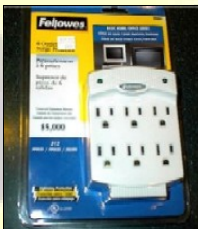
2. Multi-plug "circuit protected"