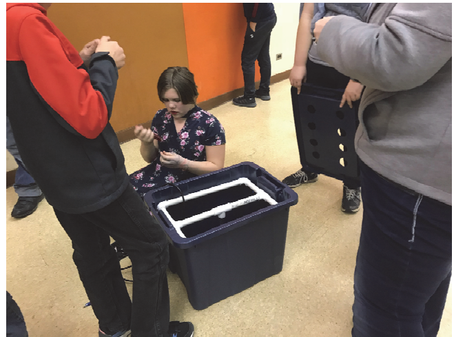
Weiser Middle School youth assemble one of two table-top hydroponic systems.

To better engage the students and help them grow more accustomed to the use of applied STEM principles, we designed a STEM series on hydroponic horticulture, which is the production of plants without soil. We researched some simple classroom designs, adapted a system design for locally available parts and purchased the materials for two units costing less than $100 apiece (Table 1). We developed seven curriculum modules to fit the 35 to 40-minute time blocks, including: What is hydroponics? – Growing plants without soil; pumps, pump output and measuring water flow; pipe cutter handling and tool safety; framing and