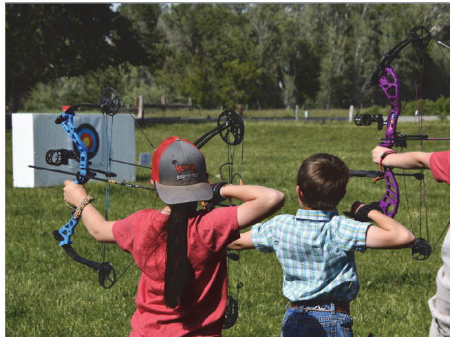
Jefferson County youth participating in archery district shoot.

Through these efforts, a total of $10,900 was awarded from the National Rifle Association which was used to purchase 18 rifles, six bows, 16 targets and various other shooting sports equipment. Twenty-one volunteers have been trained between 2018 and 2022, and six additional volunteers have been trained and led