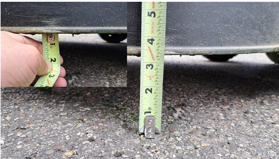
The inset shows ¼ inch to the blade. Added to the deck height and this mower is set at 3.5 inches.

Mulching the grass clippings back onto the lawn will help conserve water, reduce weed seed germination and reduce the amount of fertilizer that needs to be applied.