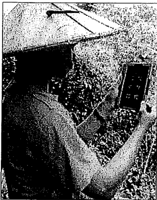
Rainforest Alliance uses OruxMaps on its Android-based tablet computers for land-cover mapping projects in Ghana (screen) and Indonesia (photo).

Given recent advances in tablet computers running Google's Android operating system and the proliferation of these devices, we felt that the time was right to test whether these tools could support our field mapping activities. The desired functionality we wanted from our Android tablet computer was: