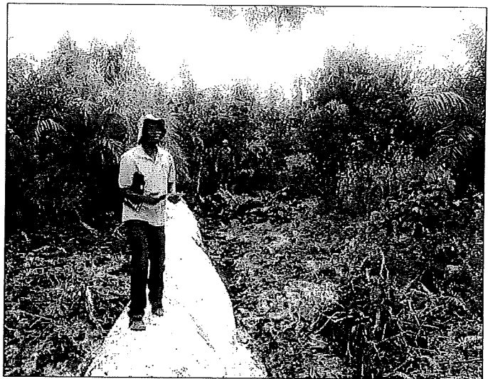
OruxMaps software running on Android tablet computers helps foresters map cocoa production in Ghana.

The easiest way to display land-cover polygons (e.g., digitized in a GIS from high-resolution imagery) in OruxMaps is to store the vector data in KML/KMZ format on the tablet and then use an Android browser to locate and open this file. When attempting to open the file, you are prompted to select the mapping application to display the data—select OruxMaps from the available options. Initially, we were unable to display polygon data, but this problem was solved after we upgraded to version OruxMaps 4.8. [As of mid-December, version 4.8.61 was available, which reportedly "Solved some bugs with kml files." The previous release, 4.8.60, added "Support for Garmin .img maps (not locked)."]