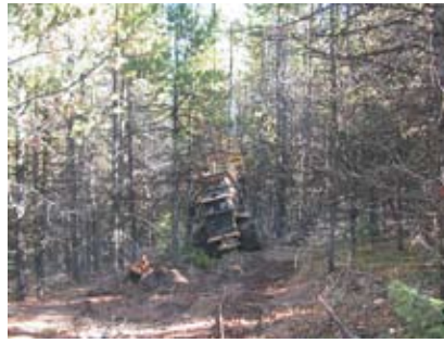
Figure 8. All-surface vehicle (ASV) with Slashbuster head, thinning young western larch stand.