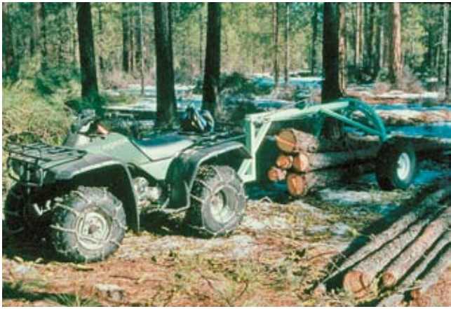
Figure 7. This ATV with a “log arch” is an example of light-duty harvesting equipment for small-diameter logs.