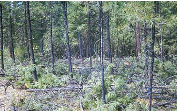
Figure 5. Heavy slash after a thinning.

Thinning can increase the amount of fuels on the ground (small branches and the like, called slash), which can substantially increase fire risk unless treated (Figure 5). In fact, after a thinning, Oregon's forest protection laws may