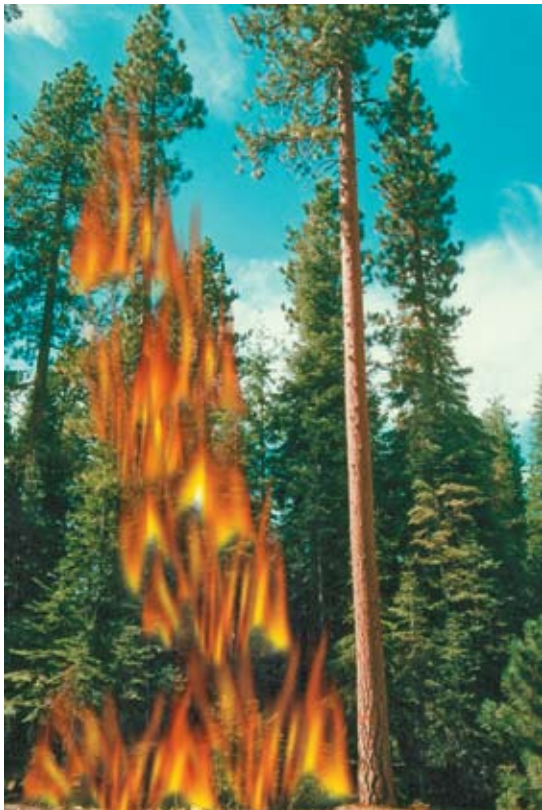
Figure 1. Thick stands with “ladder” fuels are at high risk in a fire.

Another, very important effect is that thinning increases a forest's ability to survive wildfire.