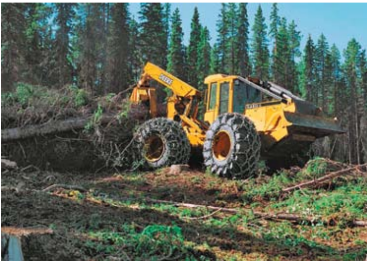
Figure 9. A rubber-tire skidder removing commercial-size trees from the woods.

from the forest and creates a clean appearance. In other cases, trees are limbed and bucked in the woods. That leaves more nutrients on the site but also more slash and thus increases fire hazard.