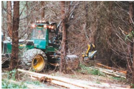
Figure 6. Mechanical harvester in young Douglas-fir stand.

Mechanical harvesting machines that fell trees, remove limbs, and cut the stems into specified