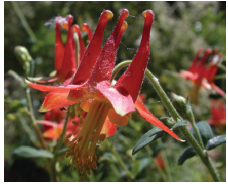
Western columbine— Aquilegia formosa

Hummingbirds feed by day on nectar from flowers, including annuals, perennials, trees, shrubs, and vines. Native nectar plants are listed in the table near the end of this guide. They feed while hovering or, if possible, while perched. They also eat insects, such as fruit-flies and gnats, and will consume tree sap, when it is available. They obtain tree sap from sap wells drilled in trees by sapsuckers and other hole-drilling birds and insects.