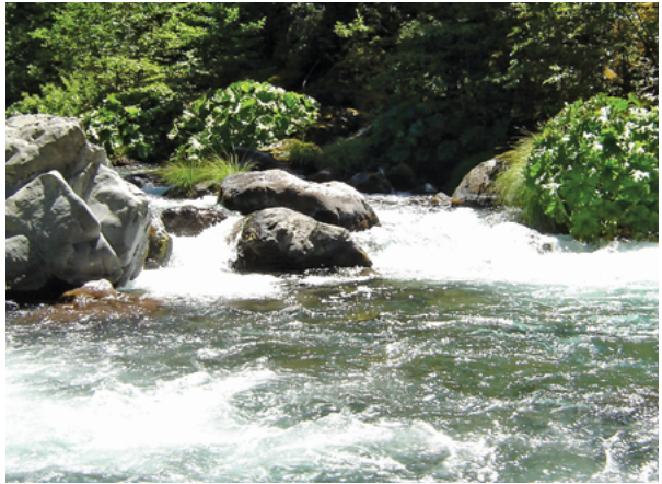
Mountain stream.

Hummingbirds get adequate water from the nectar and insects they consume. However, they are attracted to running water, such as a fountain, sprinkler, birdbath with a mister, or waterfall. In addition, insect populations are typically higher near ponds, streams, and wetland areas, so those areas are important food sources for hummingbirds.