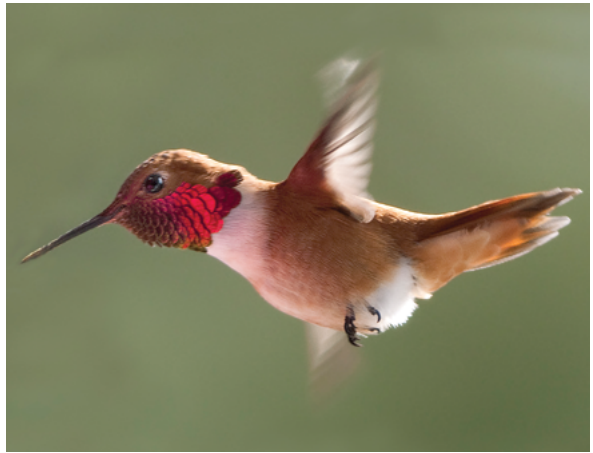
Rufous Hummingbird—male

NESTING —For breeding, they prefer second-growth forest, including clearcuts, burns and gaps. They will also use mature forests, parks, and residential areas— from sea level to 6,000 feet. Spring migration is mostly along the Pacific Flyway.