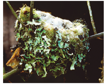
Rufous Hummingbird nest

Hummingbirds play an important role in the food web, pollinating a variety of flowering plants, some of which are specifically adapted to pollination by hummingbirds. Some hummingbirds are at risk, like other pollinators, due to habitat loss, changes in the distribution and abundance of nectar plants (which are affected by climate change), the spread of invasive plants, and pesticide use. This guide is intended to help you provide and improve habitat for hummingbirds, as well as other pollinators, in Idaho, Montana, and North Dakota. While hummingbirds, like all birds, have the basic habitat needs of food, water, shelter, and space, this guide is focused on providing food—the plants that provide nectar for hummingbirds. Because climate, geology, and vegetation vary widely in different areas, specific recommendations are presented for each ecoregion in Idaho, Montana, and North Dakota. (See the Ecoregions in Idaho, Montana, and North Dakota section, below.)