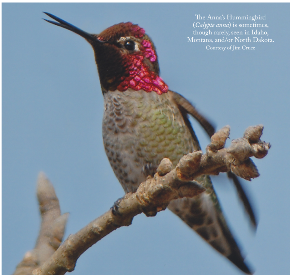
The Anna's Hummingbird ( Calypte anna ) is sometimes, though rarely, seen in Idaho, Montana, and/or North Dakota.