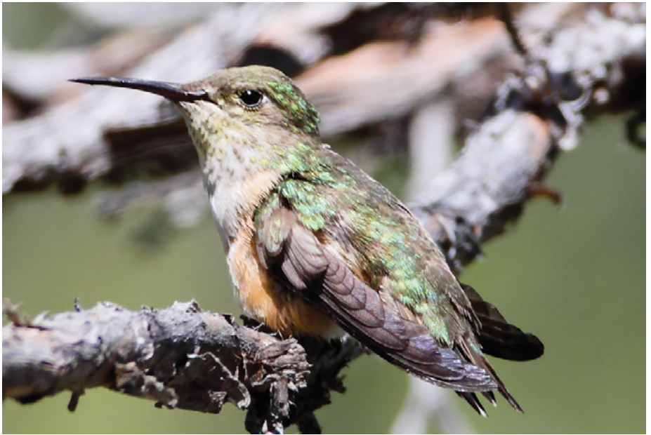
Calliope Hummingbird—female

NESTING —Preferred nesting habitat is montane conifer forests, primarily in shrub-sapling seral stage into second-growth following fires or logging, and usually near (within 1 mile) of riparian habitat. They breed mostly in mountain areas from British Columbia to California, Nevada, and Utah. They breed mainly at middle elevations (4,000 to 7,000 feet), but sometimes as high as timberline (above 9,000 feet) and down to lower forest margins (500 feet).