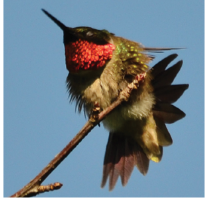
Ruby-throated Hummingbird—male

Although small numbers of ruby-throats historically overwintered in southern Florida and on the Gulf Coast, in recent winters they have become increasingly common northward to North Carolina's Outer Banks and, in some cases, even at inland locales in the southern U.S. (Most winter hummingbirds in the eastern U.S. are western species, especially Rufous Hummingbirds.) With their vast distribution across North and Central America, Ruby-throated Hummingbirds are arguably the most abundant