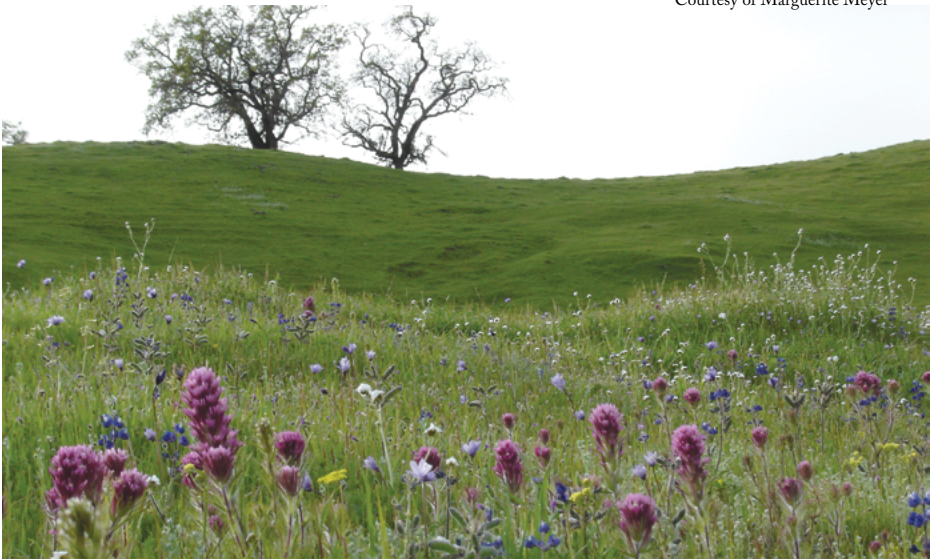
Hillside wildflowers.

ASC = Applewood Seed Co. BFI = BFI Native Seeds IGG = Idaho Grimm Growers Warehouse Corporation MM = Mountain Meadows Wildflower and Grass Seeds NI = Native Ideals Seed Company, LLC NSF = Native Seed Foundation