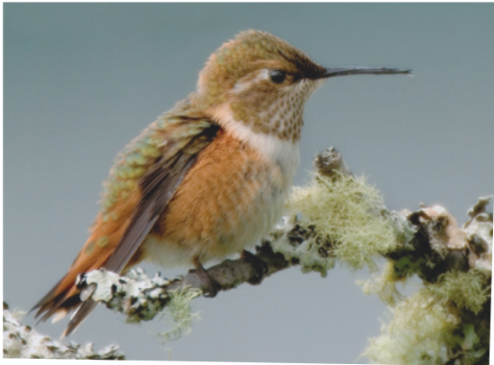
Rufous Hummingbird—female

RANGE —The Rufous Hummingbird travels farther north than any other hummingbird, wintering in Mexico and migrating to breeding sites as distant as Alaska. Although a relatively small hummingbird, it has an aggressive nature and frequently chases larger hummingbirds from nectar sources. It is an important pollinator in the cool, cloudy Pacific Northwest, where cold-blooded insect pollinators are at a disadvantage. They begin arriving in western Washington in March. East of the Cas-