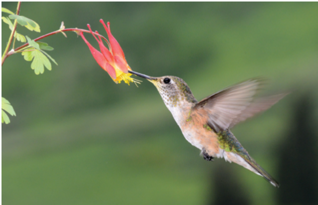
Broad-tailed Hummingbird—female

RANGE —The Broad-tailed Hummingbird is a long-winged, high elevation hummingbird whose migratory breeding populations range north across the Rocky Mountains to southern Montana and west through forested regions of Nevada and just barely make it into eastern California. This species occupies a wide