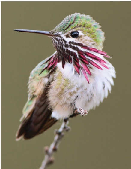
Calliope Hummingbird—male

The Calliope Hummingbird is the smallest breeding bird in North America and is the smallest long-distance avian migrant in the world. Calliope Hummingbirds occur in BCRs 9 and 10 in Idaho and Montana, and do not occur in North Dakota.