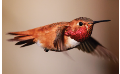
Rufous Hummingbird