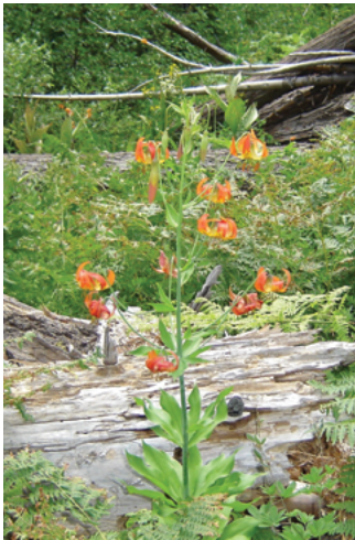
Wildflowers in meadow.

The hummingbird species of Idaho, Montana, and North Dakota are migratory, leaving in August to go to the wintering grounds in Mexico and returning to the US in April and May. Black-chinned, Calliope, Rufous and Broad-tailed hummingbirds breed in Idaho and Montana, while the Ruby-throated Hummingbird breeds in Eastern North Dakota. For hummingbird species to thrive, they need to find suitable habitat all along their migration routes, as well as in their breeding, nesting, and wintering areas. Even small habitat patches along their migratory path can be critical to the birds by providing places for rest and food to fuel their journey.