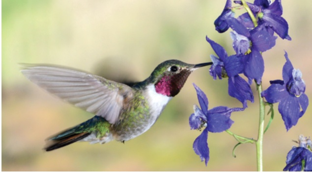
Broad-tailed Hummingbird—male

variety of mountain habitats including piñon-juniper, pine-oak, montane riparian areas and wet meadows, and areas of open mixed conifers including fir, spruce, and pine, typically at higher elevations than Black-chinned Hummingbird; these two species have only a narrow range of overlap around 6000 feet. The Broad-tailed Hummingbird occurs in BCRs 9 and 10 in Idaho and Montana, and is generally not found in North Dakota. It spends the summers breeding in southern Idaho and parts of western and southern Montana. It winters as far south as Guatemala.