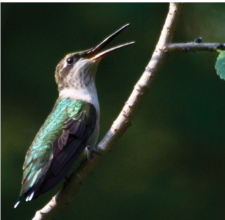
Ruby-throated Hummingbird—female

NESTING — Ruby-throats are birds of the edge; the female typically builds her nest near an open area on a downward-angled branch, sometimes overhanging water. They are far more common in hardwoods than in coniferous forests, from sea level to at least 6,000 feet in the Appalachian Mountains. Because of the density of green vegetation in the eastern U.S., Ruby-throated Hummingbird nests are