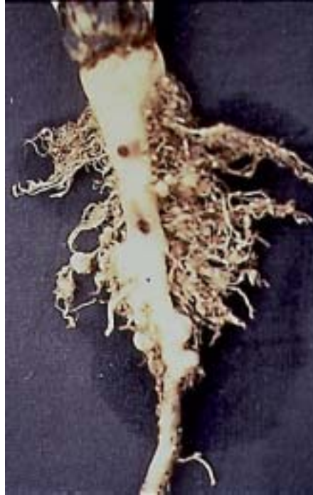
Figure 5. Root knot nematodes can cause plants to form galls on infected sugar beet roots and the main taproot.

Generally, the northern root knot nematode causes more damage on sugar beets