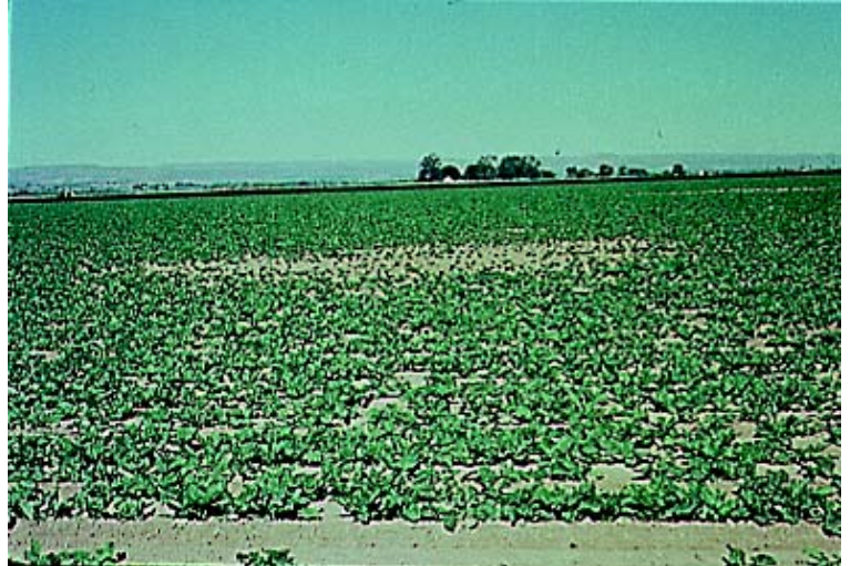
Figure 2. Typical field symptoms of nematode infestations. Foliar symptoms usually not diagnostic because they resemble symptoms of other maladies such as nutrient deficiencies or root rotting organisms.

Although there are several species of root knot nematode in this region, the two most common on sugar beet in Idaho and eastern Oregon are the Northern root knot nematode ( M. hapla ) and the Columbia root knot nematode ( M. chitwoodi ). The Northern root