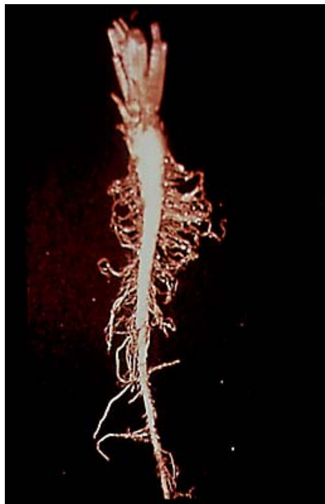
Figure 3. The sugar beet cyst nematode can cause small, excessively hairy roots. Small, white lemon-shaped females and brown cysts may be seen on beet roots infested with the sugar beet cyst nematode.