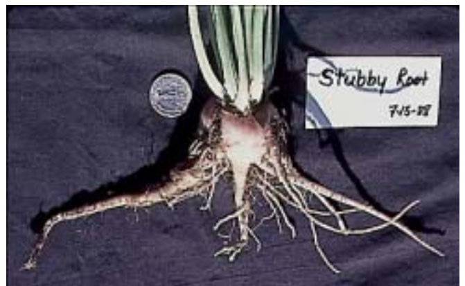
Figure 7. Forked, distorted root symptoms caused by a stubby root nematode infection.