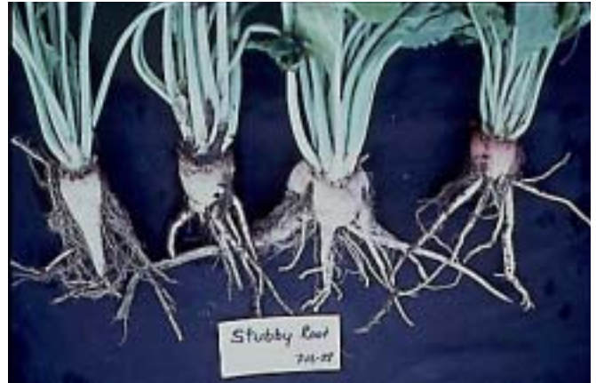
Figure 6. Stubby root nematodes cause stubby-ended, swollen tips.

Stubby root nematodes feed on main tap roots and lateral root tips, causing swollen, stubby-ended root tips (Figure 6). Root tips are often killed by these nematodes, and surviving roots become branched (forked) and distorted (Figure 7). Plants are seldom killed by this nematode. Damage by stubby root nematodes is greater in wet seasons. Above ground symptoms caused by the stubby root nematode resemble symptoms of other nematodes and can include poor growth, yellowing, and stunting.