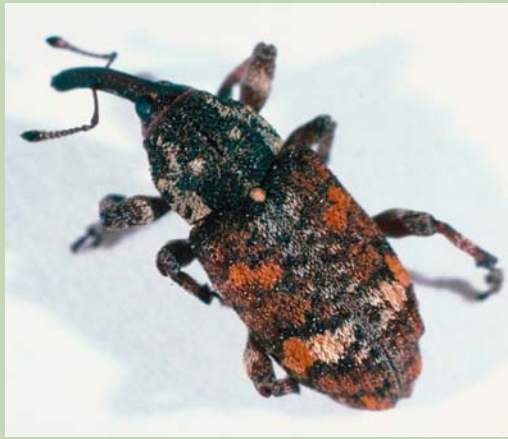
Figure 2: Adult white pine weevil is 1/4-inch long and mottled brown. Adults are the only life stage that directly can be seen crawling on trees.