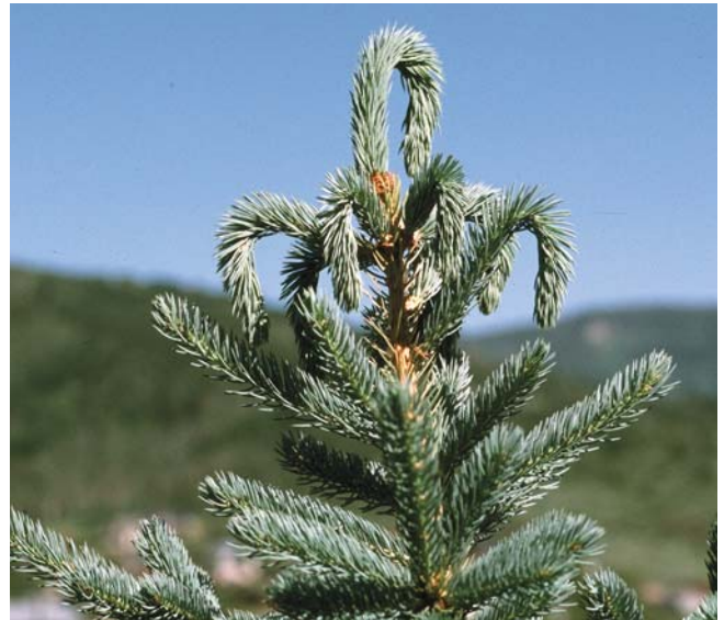
Figure 5: Wilted top of Colorado spruce is an indicator the tree is infested with white pine weevil.

Remove competing branches. Other branches may try to grow upwards naturally. Or, if no action is taken, several new tops may develop. These should be cut off to leave only one strong terminal. This will preserve the structure of the tree