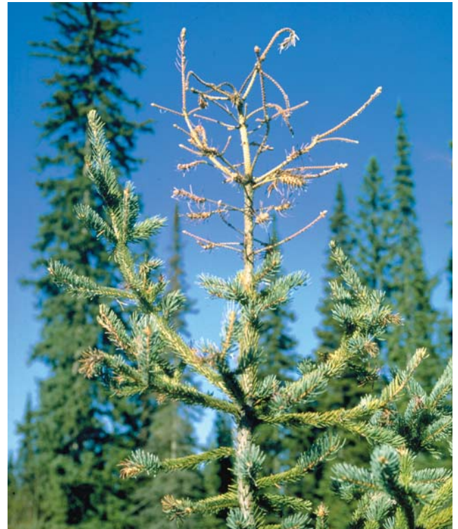
Figure 1. Top kill in Colorado blue spruce is caused by white pine weevil after it infests and kills a spruce tree's main shoot.

Larvae are small creamy-colored C-shaped legless grubs with reddish brown heads. Larvae only are visible by scraping away the outer bark of infested terminal shoots (Fig. 3).