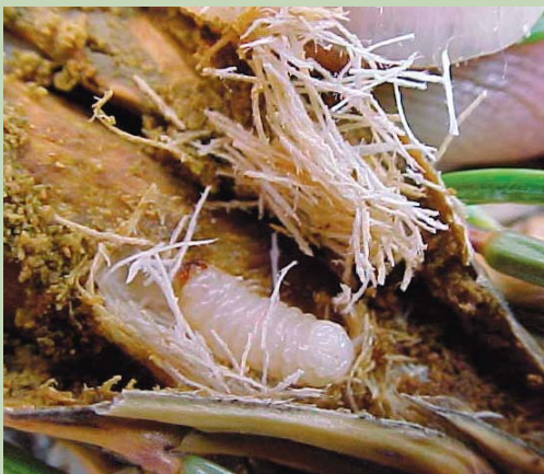
Figure 3: Mature weevil larva in chip cocoon is visible only by scraping away the outer bark of infested terminal shoots. By the pupal stage, much of the top 18-inch of stem has been chewed up under the bark, causing needles to turn brown.

females lay eggs within punctures they chew just below the terminal bud on the dormant leader during April to June.