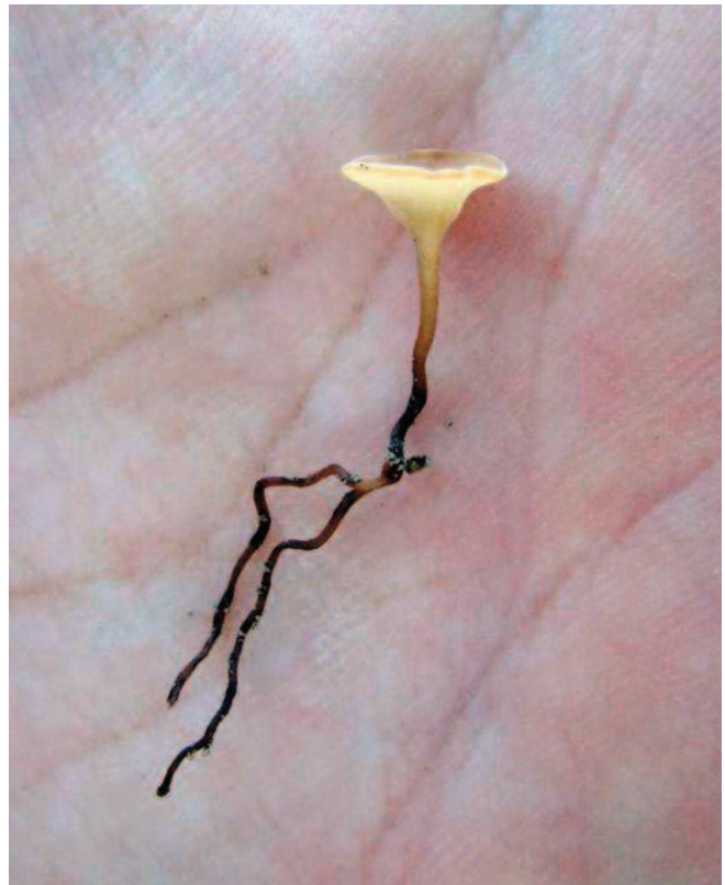
Figure 4. In late spring, sclerotia germinate to produce small, pink to beige, mushroom-like discs called apothecia.