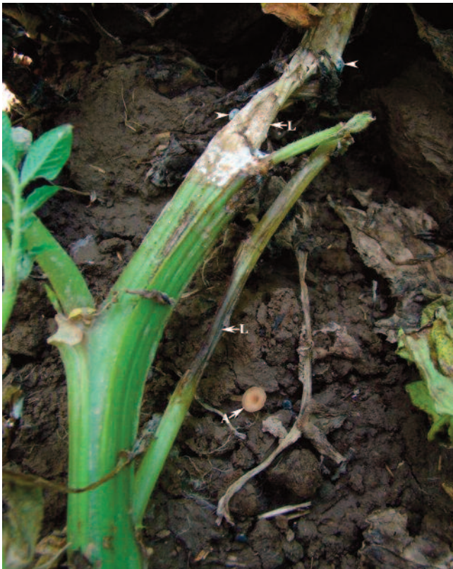
Figure 3. As infected tissue decays, hard resting structures called sclerotia (arrowheads) form inside and outside the decaying lesions (L). An apothecium (A) can be seen next to the infected stem.